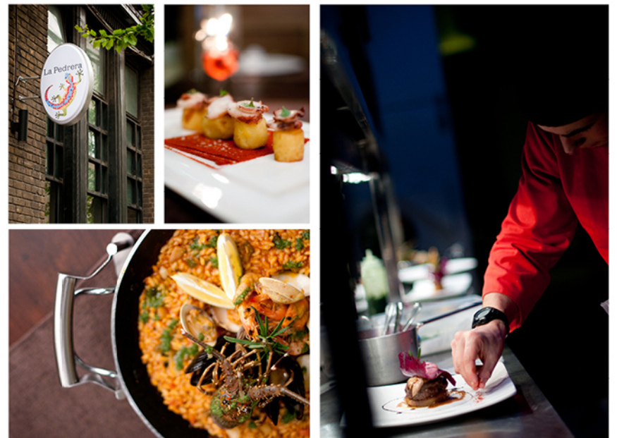
LA PEDRERA RESTAURANT