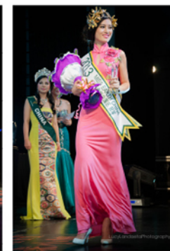
MISS EARTH CHINA