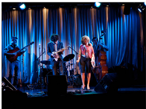
TDN NYC CONCERT