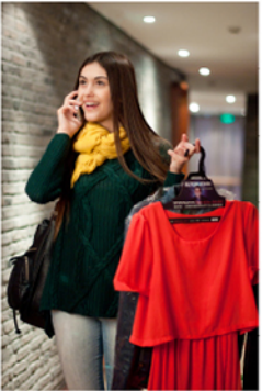
YOU TONG HANGERS AD